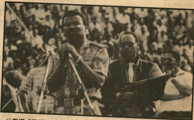
□ THE GENERAL: In camouflage combat gear at a mass rally.

Pointing out that the targets in King William's Town, Queenstown and Cape Town were in traditional-