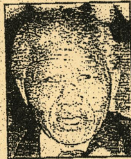
Mandela... only Codesa could allay the genuine fears of both whites and blacks.