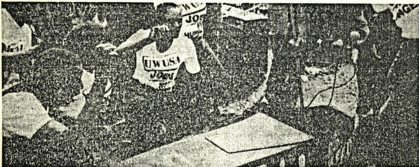
The launch of UWUSA, announcing that it intended to bury Elijah Barayi and COSATU, was a direct challenge to organised workers and youth.

UWUSA was launched by Buthelezi's Inkatha in May 1986. It is not a union. It is not even a "tribally-based union". It is an armed gang created for no other purpose than to break strikes and unions. For all its claims of more than 100 000 worker "members", UWUSA has not led a single strike since its foundation.