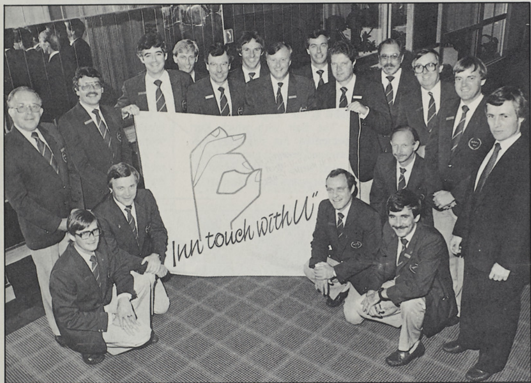
Senior management and GMs display the "Inn Touch with U" banner during the launch seminar at the Marine Parade Holiday Inn.

A MAGAZINE FOR THE STAFF OF * Holiday Inn