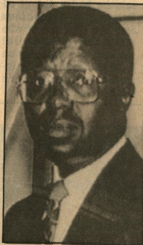
Dikgang Moseneke ... resigned.

In a letter to PAC president Clarence Makwetu, Moseneke said he had neither political ambitions nor a desire to hold political office in any future government.