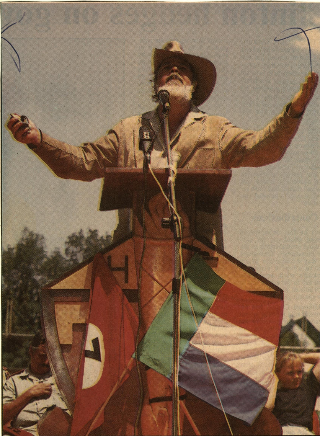
Calling his Volk to war . . . AWB leader Eugène Terre'Blanche addresses a Day of the Vow rally in Kempton Park yesterday, warning that his organisation will not allow land belonging to Afrikaners to be taken.