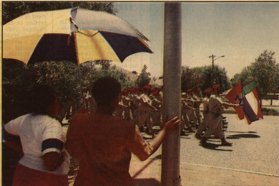
Discreet viewing . . . a few nervous people watch heavily armed AWB members parading through Kempton Park on the East Rand yesterday during their militant Day of the Vow celebrations.

TerreBlanche, who said the time was right to renew the Day of the Vow, called on his supporters to commit themselves to fighting to death in the coming war which, he said, President de Klerk and ANC presi-