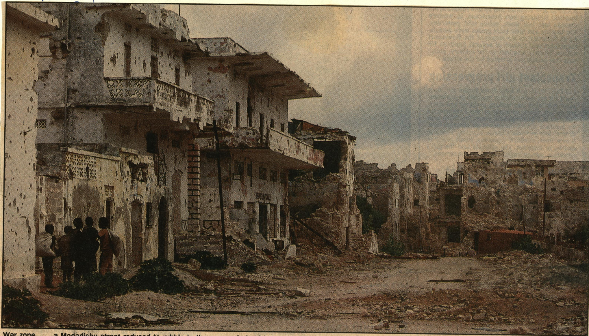
War zone . . . a Mogadishu street reduced to rubble in the no-man's land between the two warring factions fighting for control of Somalia.