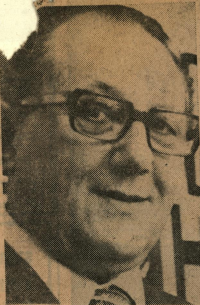
Mr Jimmy Kruger . . . strong action

THE MINISTER OF JUSTICE, Mr Jimmy Kruger, yesterday promised South Africa: I will do all I can to put right whatever is wrong in our prisons system.