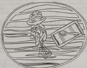
4. The water is warmer but Leroy soon settles down to make the best of his new situation, not realising that someone is implementing a hidden agenda.