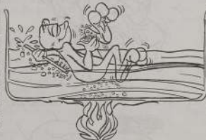
5. You're in great danger, Leroy! The water is being heated up! Do something about it now! Jump out before it is too late! But Leroy won't listen. He adjusts to the rising temperature and hopes things will not get worse.

You're in great danger, Christian! The Biblical values built into your way of life over the centuries by the blood of countless martyrs are being systematically undermined. It is still not too late to reverse the trend. But you must act NOW! Identify the values that need to be preserved and start working to save them NOW!