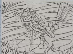
6. Too late! Leroy has waited too long! The water is now so hot that he is no longer able to hop out!

4. Gather your friends together to pray and plan the kind of