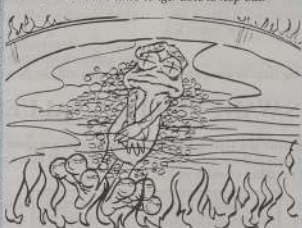
7. The end is inevitable. Leroy has been boiled alive! Christian, if you fail to act NOW, you will soon find yourself in a land dominated by secular humanist moral values with growing restrictions on your ability to present the Gospel as the only way of salvation. Then it will be too late. But you can still do something NOW!