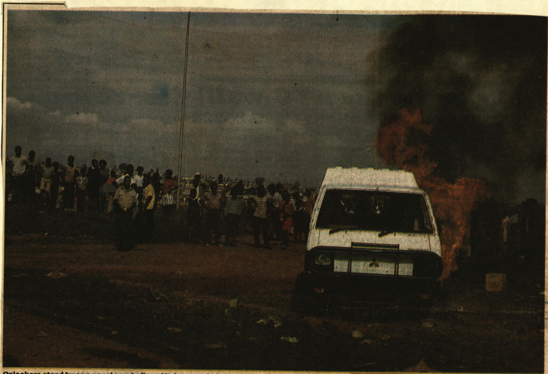
Onlookers stand by as a panel van, believed to be an ambulance responsible for the rumoured kidnappings, goes up in flames.