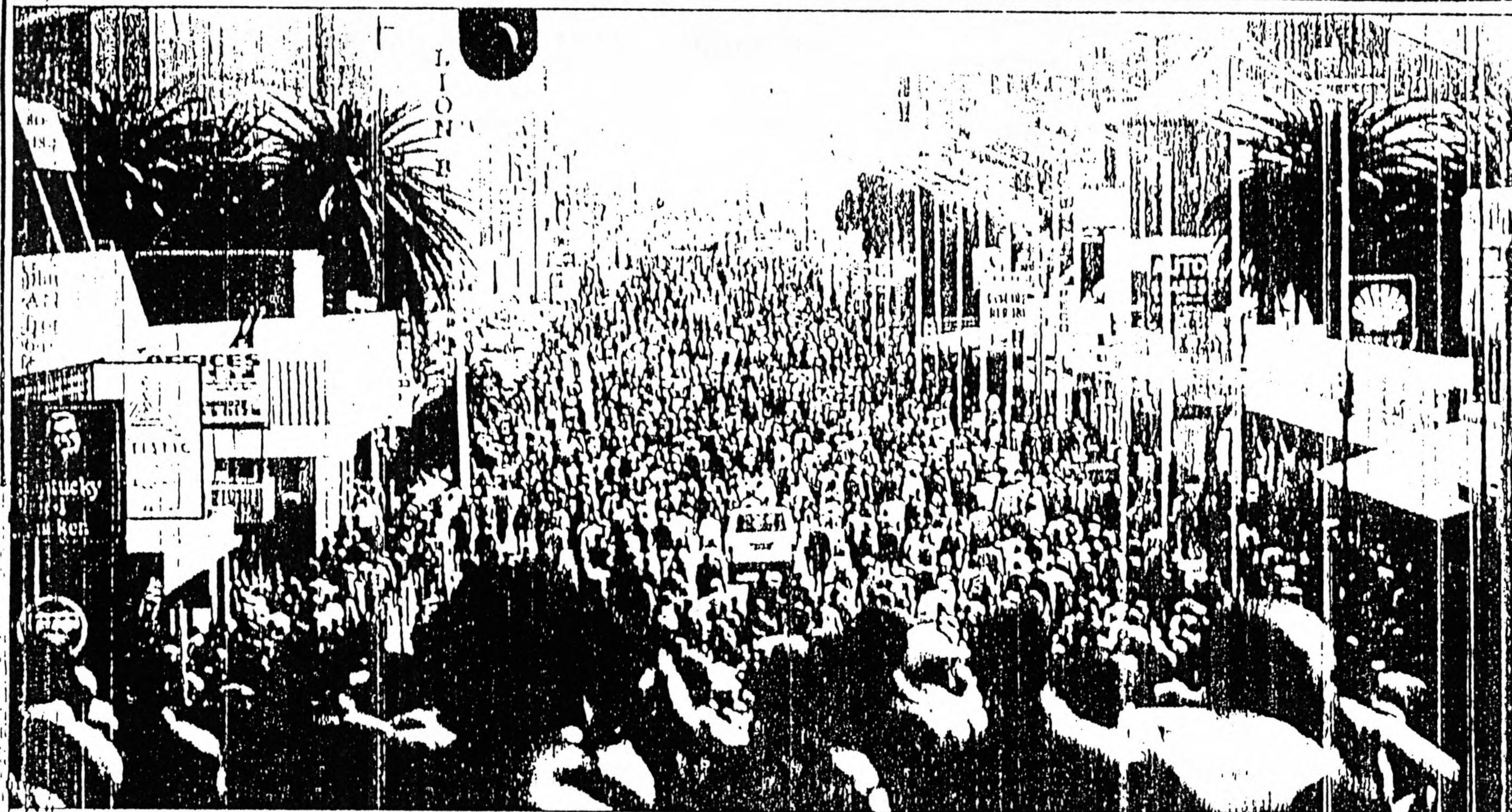
FINAL PUSH ... Tens of thousands of ANC supporters marched through Pretoria this week, voting with their feet to endorse calls for peace and democracy at the Union Buildings, the seat of the government's executive power. ■ PLOI THULANI BITHOLE