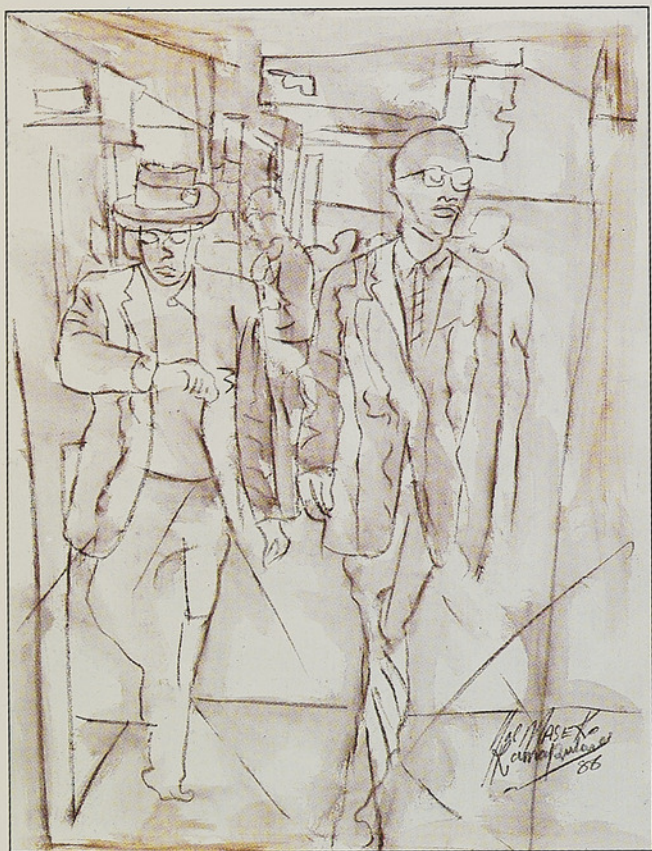
Walking in Johannesburg 1004 x 790mm