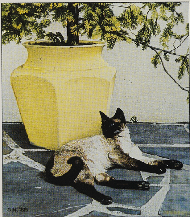
Andrew 110 x 125mm