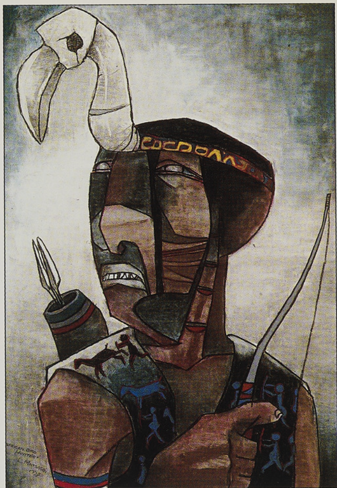
African Bird Hunter 605 x 838mm