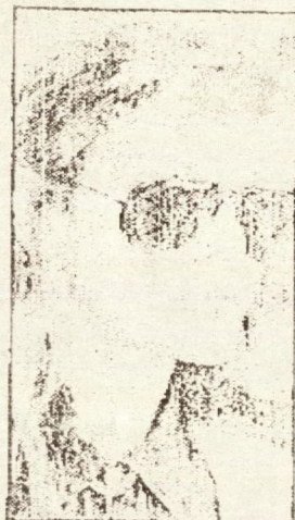
JANI ALLAN: No "absolute sexual intercourse".