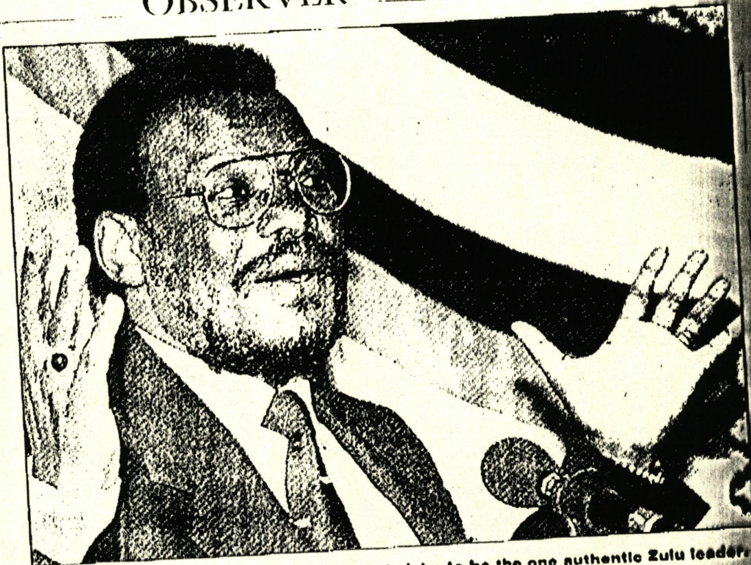
No surrender: Chief Buthelezi, who cannot claim to be the one authentic Zulu leader.

Klerk's National Party. Although Buthelezi proclaimed last week that Inkatha was 'a national political force', he has clearly abandoned his efforts to build a national constituency and is beating 'the Zulu ethnic drum in a frantic bid to consolidate regional support.