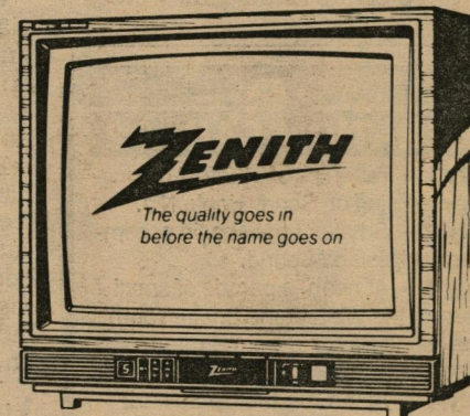
A 20" COLOR TV WITH REMOTE CONTROL AND 178 CHANNEL TUNING.