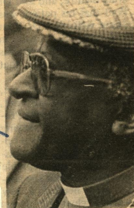
Archbishop DESMOND TUTU at the Delmas treason trial yesterday.