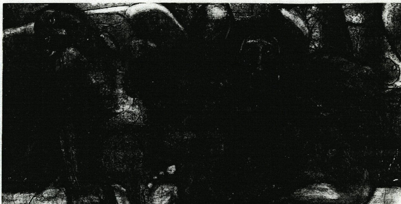
No. 12 Fallen Kings by Louis Maqhubela