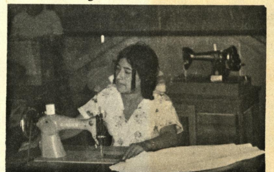
Guatemalan women learning to sew

Elsewhere, CNEC has followed up its earthquake relief in Guatemala by encouraging nationals in self-help projects. In the towns of Chimaltenango and Palencia, for example, women are being taught sewing and other homemaking skills in centers directed by the Instituto Evangelico America Latina.