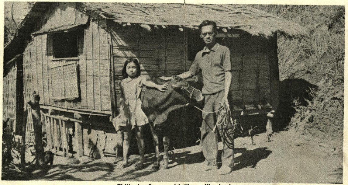
Philippino farmer with "loaned" animal