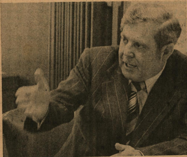
Minister of Economic Affairs, Mr Heunis.

"Was there a more effective way to expose to the bone the whole matter, de-