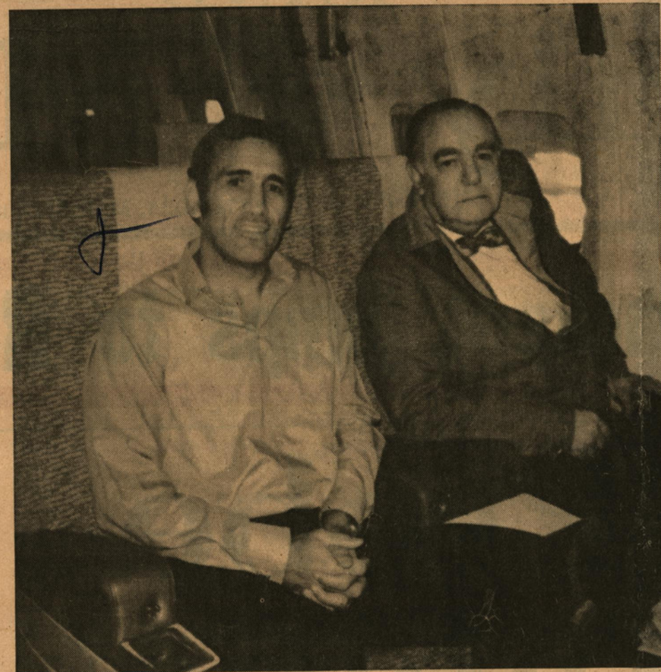
Mr Vorster and Dr Rhodie on one of their overseas trips. "We had to drag Mr Vorster kicking into Africa," Dr Rhodie told the Rand Daily Mail yesterday.