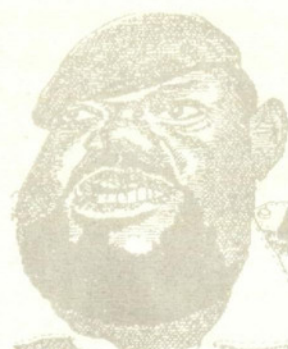
Jonas Savimbi ... defeated in elections.

A regional solution in KwaZulu and Natal in defiance of what South Africans elsewhere might