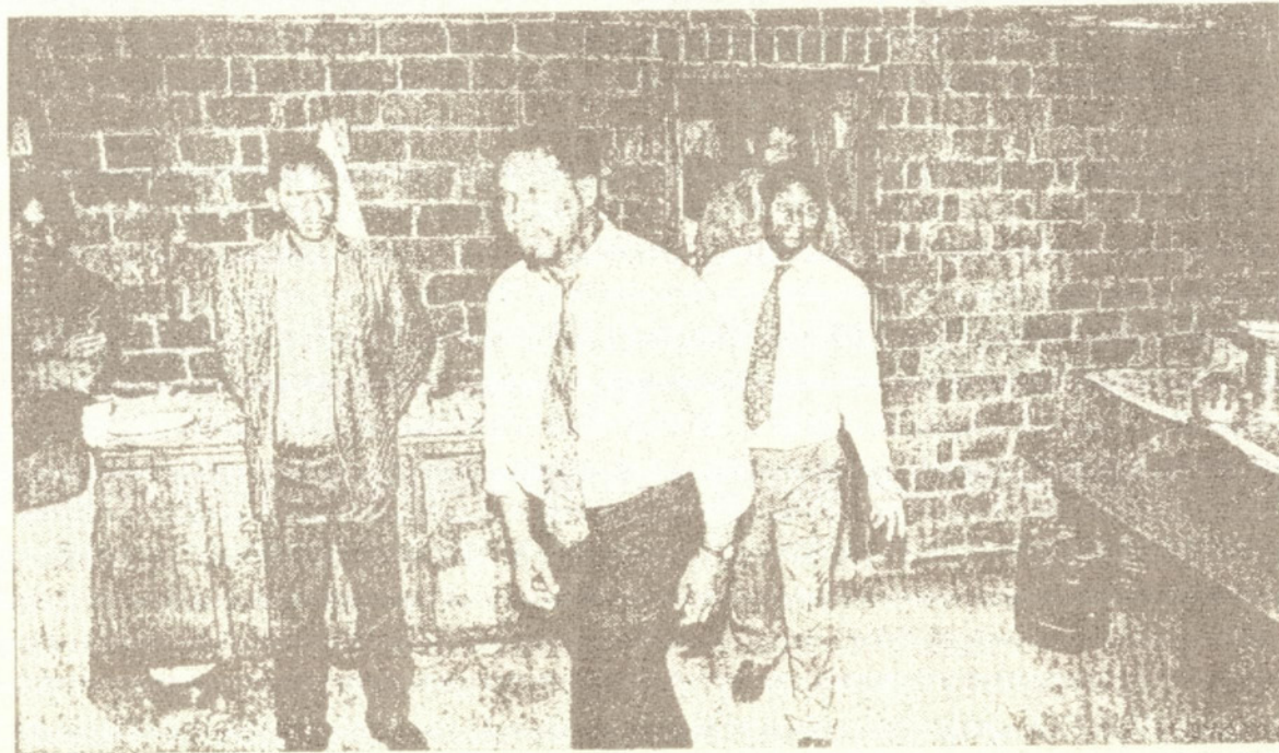
ANC PWV region chairman Tokyo Sexwale, centre, inspecting Meadowlands hostel yesterday.

BUSINESS DAY, Thursday, December 10 1992