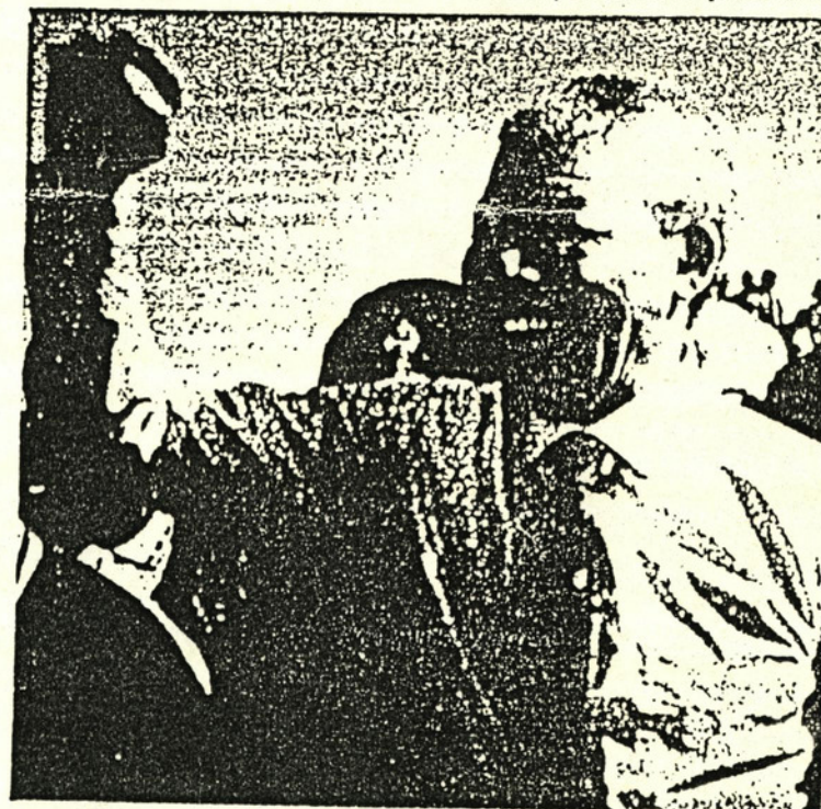
Nelson Mandela was given a hero's welcome when he visited the United States.

We had peace in South Africa, but the problem came under Grand Apartheid when, while we were setting up the independent tribal homelands, we still allowed these other Blacks to remain in South Africa proper and get greater and greater power. So today Johannesburg is the murder capital of the world. We have all of these different tribes killing each other. ●