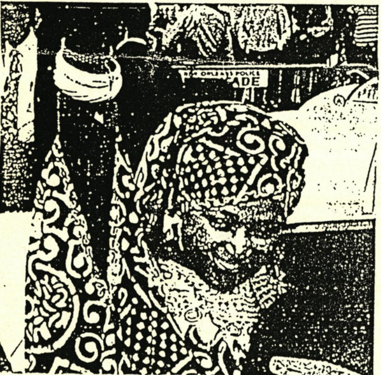
Winnie Mandela has pointed an accusing finger at the African National Congress.