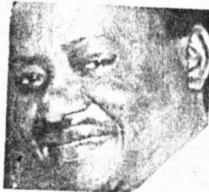
QOBOZA Celebrities XI

playing at 4.45pm until 5.15pm - for 30 minutes only.