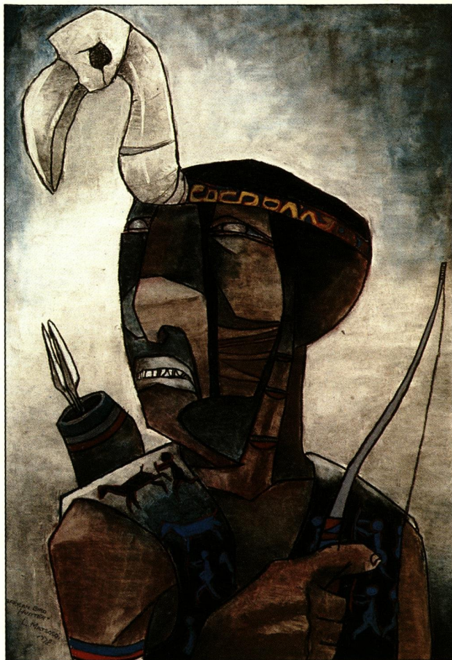
African Bird Hunter 605 x 838mm