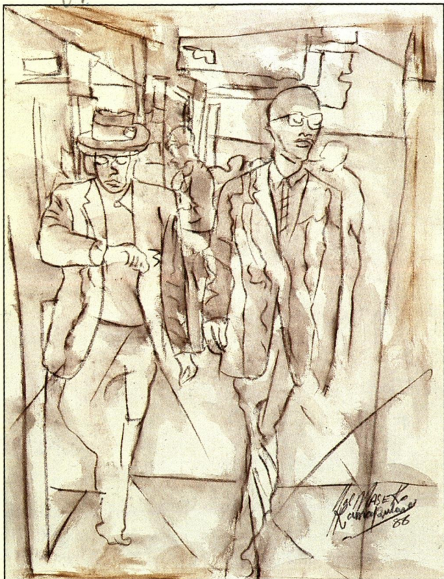
Walking in Johannesburg 1004 x 790mm

1 Karate Stroller Sunday afternoon Self portrait Family portrait weekend L.O. v.o.e.