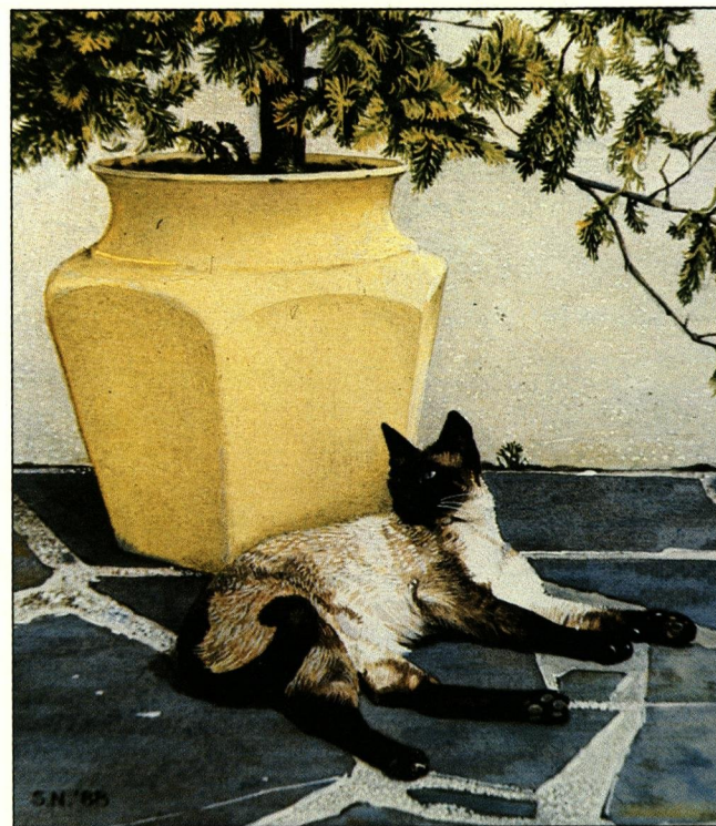
Andrew 110 x 125mm

T's unit Alger von Blackwood B X 101 Muzieus Pauitokok