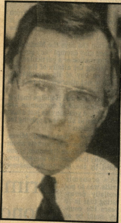
□ BUSH ... looking for answers

The fact is that in American election politics, there is no such thing as a solemn oath. Platforms are generally torn up as soon as the election is