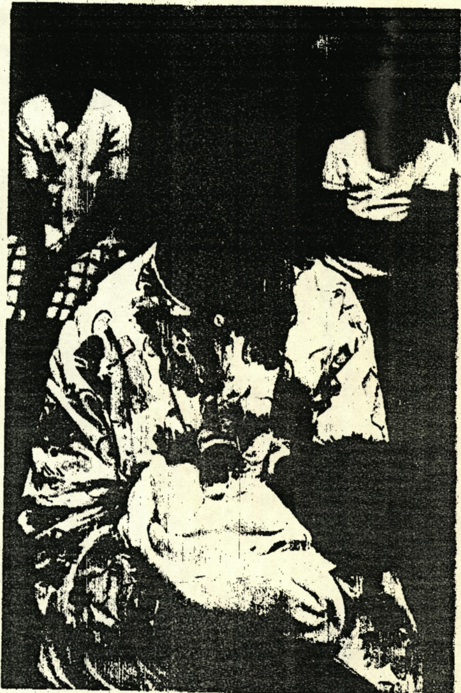
The face of pain: One of the many Ashdown families who sought refuge in Cosatu's Pietermaritzburg offices this week. Days later Inkatha supporters tried twice to storm the office, but were repelled.

Workers have also stressed to management that the warlords are