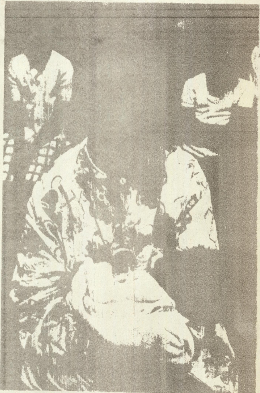
The face of pain: One of the many Ashdown families who sought refuge in Cosatu's Pietermaritzburg offices this week. Days later Inkatha supporters tried twice to storm the office, but were repelled.

Workers have also stressed to management that the warlords are