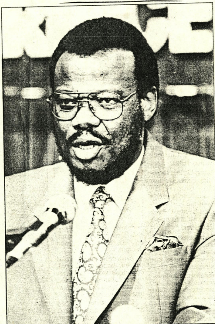
Chief Buthelezi in Hongkong...walking a tightrope.

Chief Buthelezi seems to realise the enormity of real power in South Africa and he resigns himself to it, and with it the corollary that all political power, no matter who is holding it (and that includes the ANC with whom Anglo chairman Gavin Relly has had open talks), will play second fiddle.