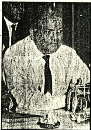
Pravin Gordhan... seen as the official "voice of Codesa".

P RAVIN Gordhan's name was well known in activist circles a long time ago, but now the whole country hangs on his words as the "voice of Codesa".