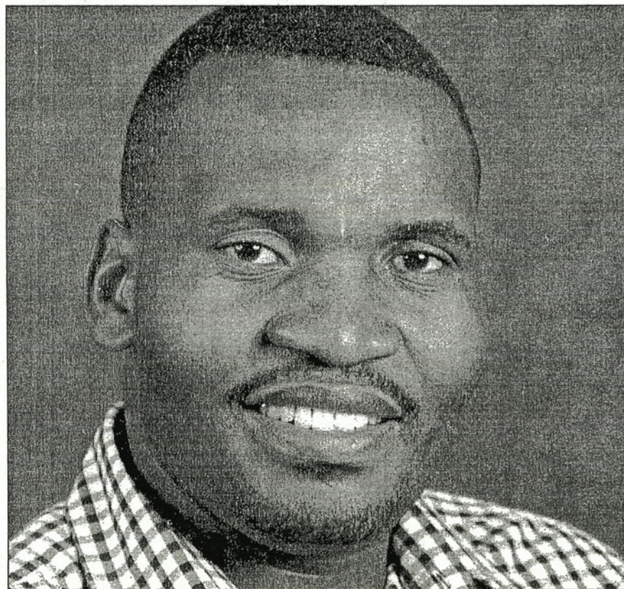
ON PARITY: Minister Sicelo Shiceka has called for councillors to get a pay raise.